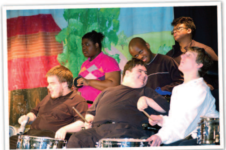
L.I.F.E. students perform in the Annual Spring Concert.

If you would like to see our students perform or would like to support the music and arts program at MSB with a donation, please visit our website for more information.