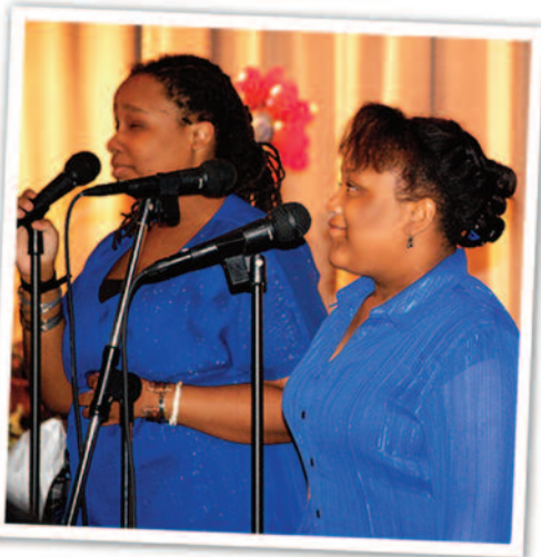
The multi-talented Blue Duffs Jazz Ensemble